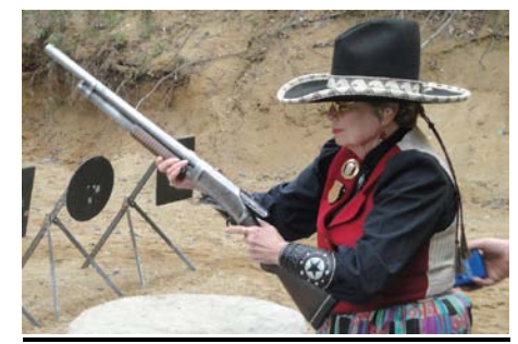
Cat Ballou, SASS #55